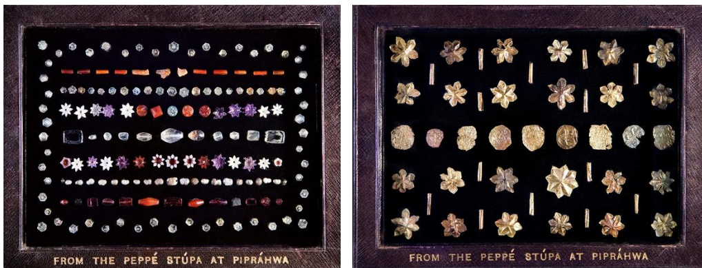
The Gems from the Stupa, Box B; Piprahwa, India; discovered and encased January 1898; various gemstones; box dims.: 20 x 15 x 2 cm; photograph by Charlotte MacMillan; courtesy of Chris, Luke, and Daniel Peppé

Opening May 31, 2019, “Charged with Buddha’s Blessings: Relics from an Ancient Stupa” showcases power objects from the Piprahwa stupa in northern India, on view for the first time in the United States